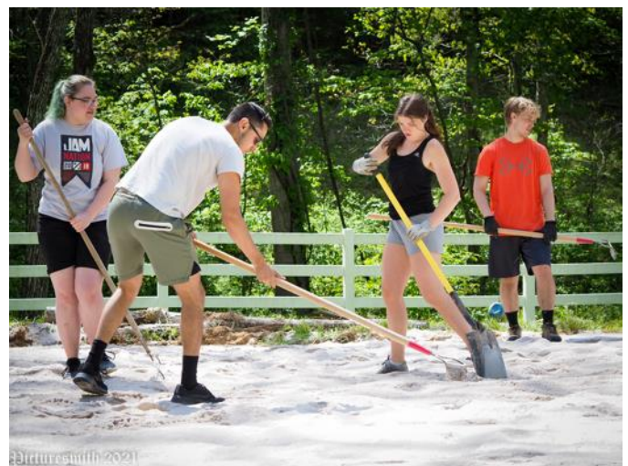
Students from Christian Student Foundation at Ball State University (Indiana) working at the volleyball court with the new sand to get it ready to open.

Let us know if you are looking for a job. We cannot keep up with the groundskeeping, cleaning for visitors, ongoing project work, and programming at camp. We can provide room and board, as needed. Contact us at cmmbc1950@gmail.com or 276-346-1013 if you have any questions or interest in working at CMMBC.